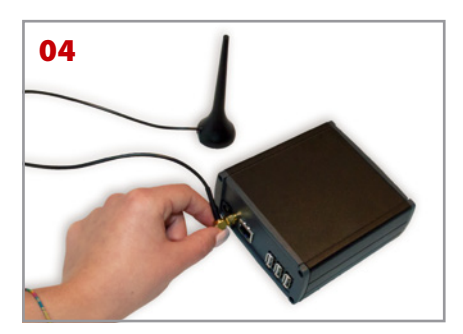
Plug-in the antenna connector.