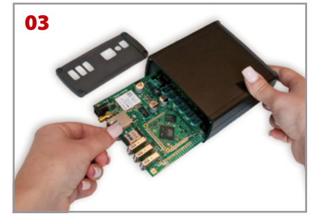
Close the FOXBOX case.