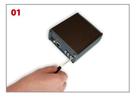
Open the FOXBOX case removing all the Insert the SIM card in the placeholder. screws. Extract the electronic inside.

Note: before starting the installation, please check that the SIM doesn't have a PIN code. In case there is, please remove it using a common mobile phone.