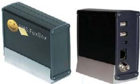
Acme's SMS FoxBox

The forces at Acme Systems and KDev, two veteran embedded Linux system and software developers based in Italy, have conspired to bring the world SMS FoxBox. It's a Linux-based box dedicated to sending and receiving SMS messages that can be managed through a Web interface. It can handle up to 30 incoming messages at a time on a common SIM card. It also works as an SMS to TCP/IP gateway, so you can combine SMS messaging with network and user applications. You can SMS to and from e-mail, MySQL, Web scripts, desktop widgets, whatever.